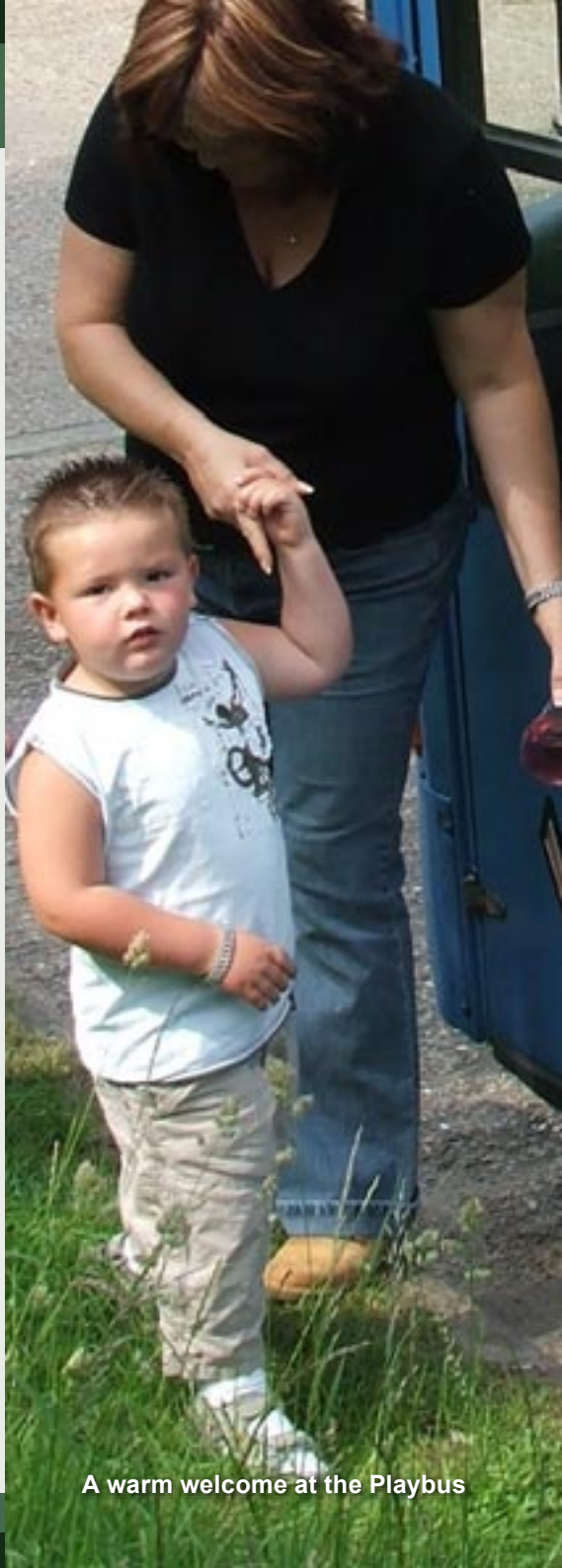
A warm welcome at the Playbus

We worked with the Countryside Agency on this survey, which helped inform the targeting of Government funds.