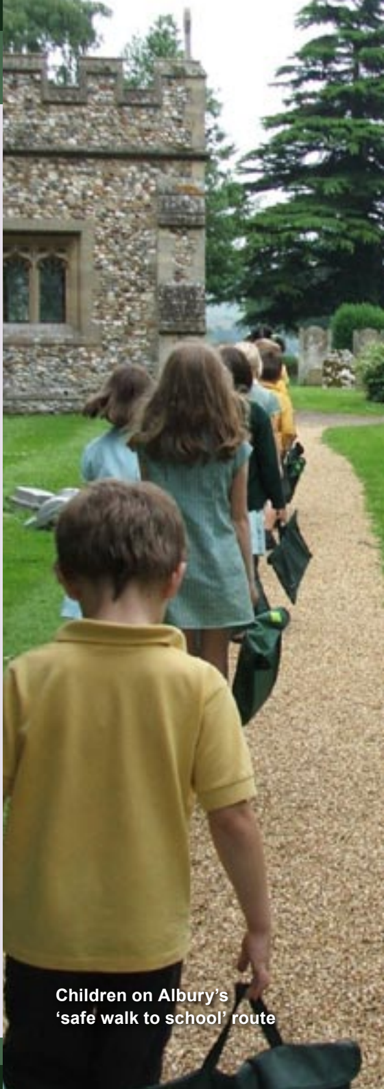
Children on Albury's 'safe walk to school' route